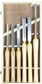
W302 HSS Wood Turning Tools - 6 Piece Set