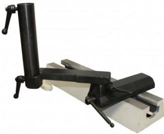
W387A Bowl Turning Attachment