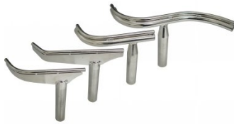
W295 Curved Tool Rest Set