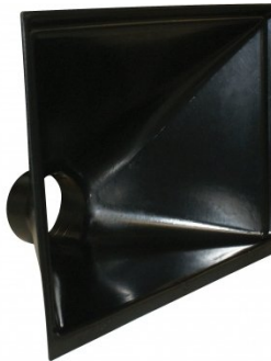
W338B Wood Lathe - Dust Chute - Big Gulp