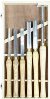
W302 HSS Wood Turning Tools - 6 Piece Set