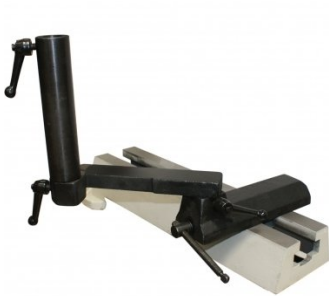
W387A Bowl Turning Attachment