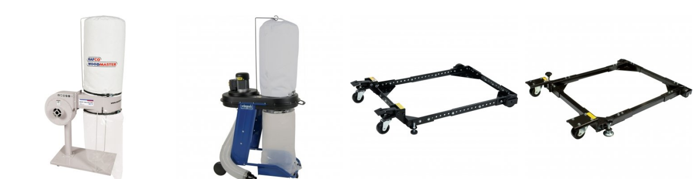
W931 Mobile Base - Heavy Duty