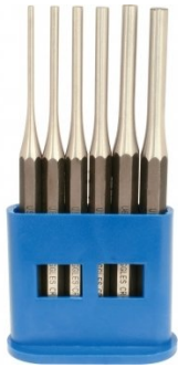
P365 Pin Punch Set - 6 Piece