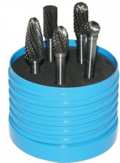
B900 Carbide Burr Double Cut Set - Short Series