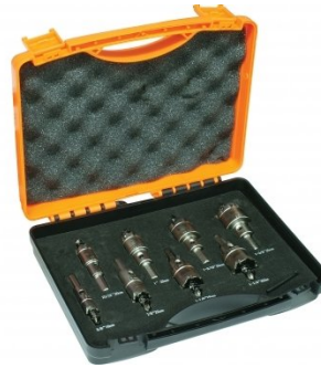
D108 Metric Carbide Tipped Hole Saw Set