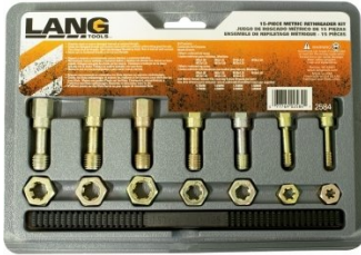
T115 Metric Thread Restorer Tap & Die Kit - 15 Piece