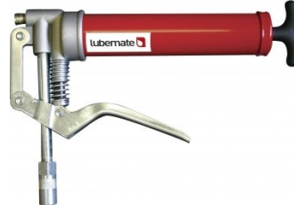
G070 Grease Gun