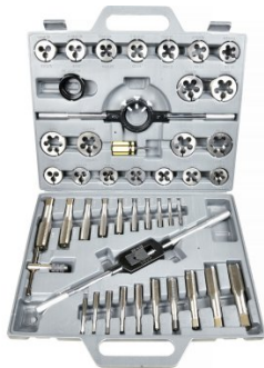
T015 Imperial Alloy Steel Tap & Die Set - 45 Piece