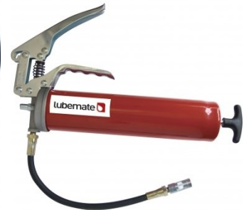
G072 Grease Gun