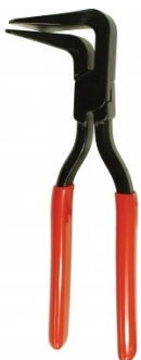
S205 90° Edge/Seaming Plier