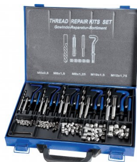
T100 Metric Thread Repair Kit - 130 Piece