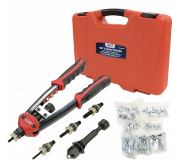
N001 Nut & Blind Riveter Set - 130 Piece