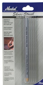
W104B Silver Streak - Welders Pencil