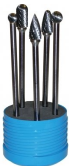
B905 Carbide Burr Double Cut Set - Long Series