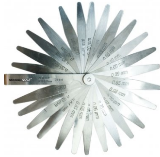
Q616 Feeler Gauge Set