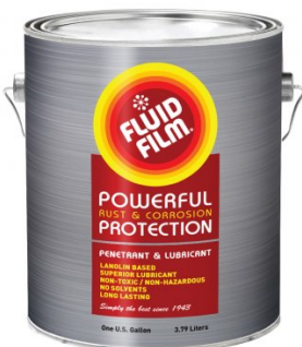
O044 Rust & Corrosion Preventive