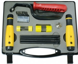
D065 Universal Deburring Tool Set - 23 Piece