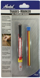
W104 Trades Marker - All Purpose