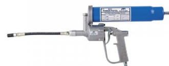
G066 Air Operated Power Pistol - Grease Gun