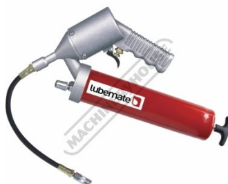
G074 Air Operated Grease Gun