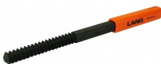
T119 Metric Thread Restorer File