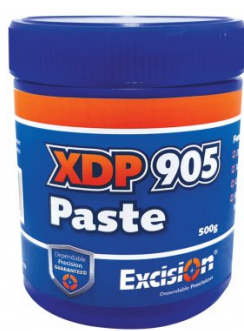
S074 Cutting Tool Lubricant Paste - 500g