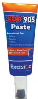
S075 Cutting Tool Lubricant Paste - 200g