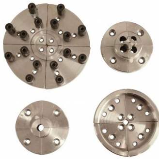
W375 Scroll Chuck Accessory Kit