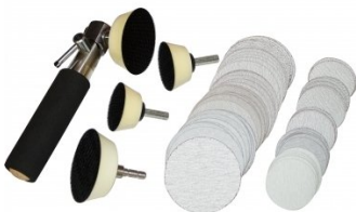
W305 Bowl Sanding Tool