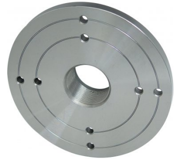
W298 Face Plate