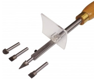
W300 Carbide Wood Turning Tools - 6 Piece Set