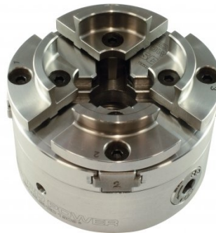
R8175 Scroll Chuck - 100mm - with Bonus 50mm Face Plate Ring