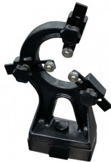
W378 Roller Steady