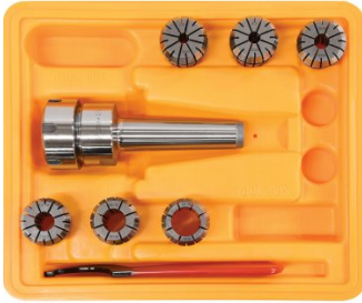
C922B Collet & Chuck Set - 8 Piece