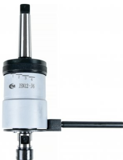
T004 Reversible Tapping Chuck - Adjustable Clutch