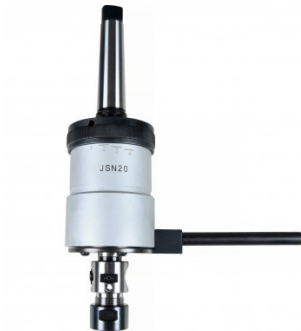
C292 Industrial Drill Chuck - Keyless Type