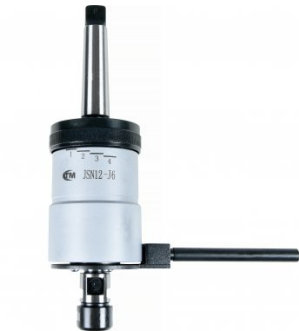
T004 Reversible Tapping Chuck - Adjustable Clutch