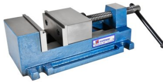
V142 Safeway Precision Drill Press Vice