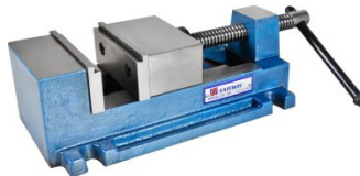
V141 Safeway Precision Drill Press Vice