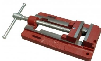
V138 Drill Press Vice