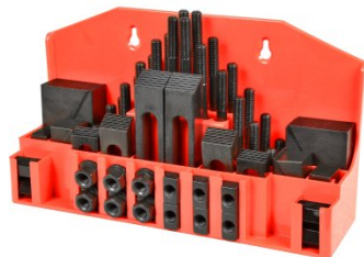
C096A Clamp Kit 58 piece - Industrial Series