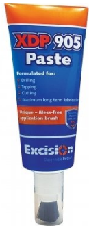
S075 Cutting Tool Lubricant Paste - 200g