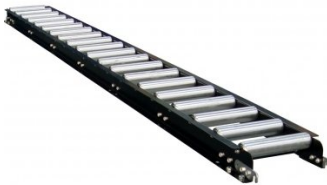
L812 Roller Conveyor