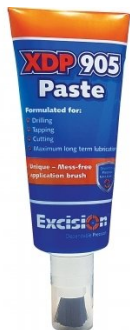
S075 Cutting Tool Lubricant Paste - 200g