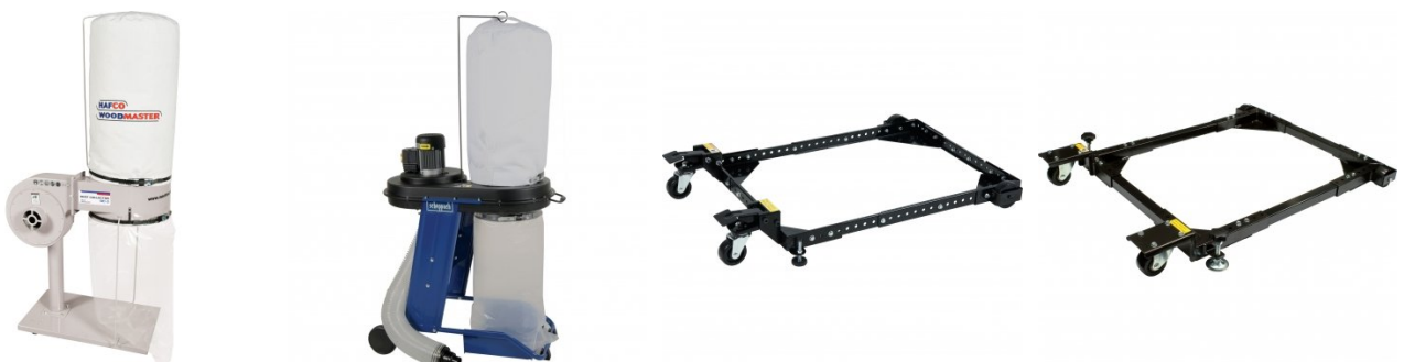
W931 Mobile Base - Heavy Duty