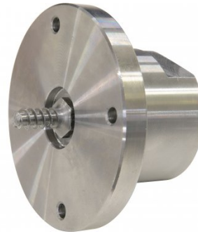
W298 Face Plate