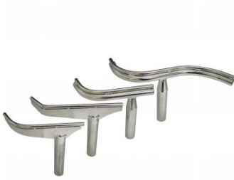
W300 Carbide Wood Turning Tools - 6 Piece Set