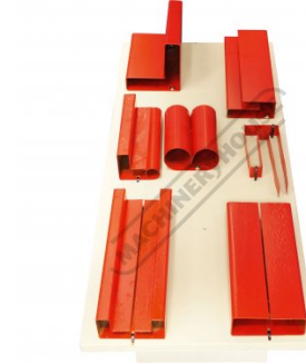
Examples of Bends