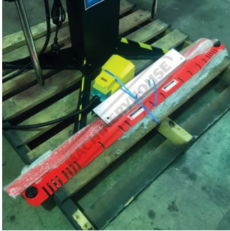
Slotted & Narrow Clamp Bar