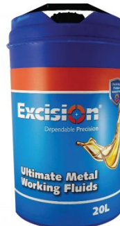
S091 Soluble Metal Cutting Fluid - 20 Litre