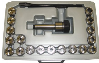
C926 Collet & Chuck Set - 20 Piece