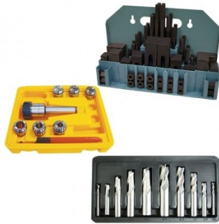
K150 Mill-Drill Accessory Package Deal - Imperial Cutters