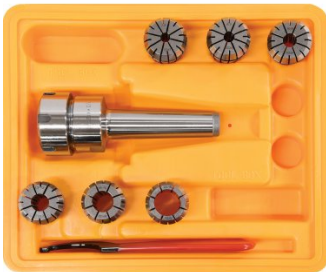
C922B Collet & Chuck Set - 8 Piece