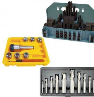
K151 Mill-Drill Accessory Package Deal - Metric Cutters