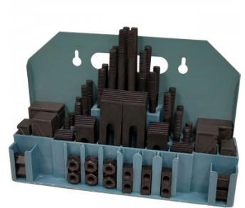
C0965 Clamp Kit 58 piece - Workshop Series