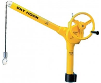
A358 Sky Hook Lifting Device