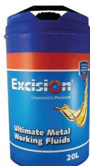
S091 Soluble Metal Cutting Fluid - 20 Litre