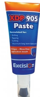
S075 Cutting Tool Lubricant Paste - 200g