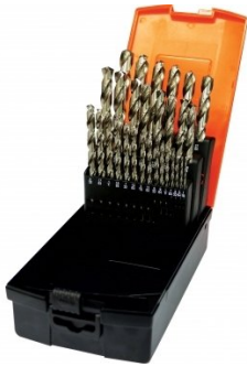
D1282 Imperial 135° Precision HSS Drill Set - 29 Piece