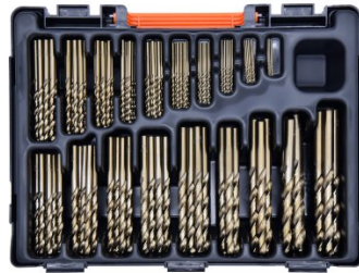
D126 Metric 135° Precision HSS Drill Set - 170 Pieces