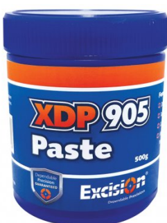
S074 Cutting Tool Lubricant Paste - 500g