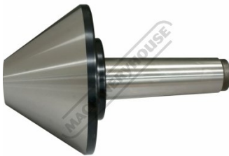
C047 5MT Pipe Centre - 70° Cone