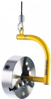
A358A Chuck Hook