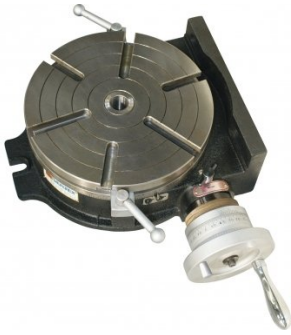
R010 Vertex Rotary Table