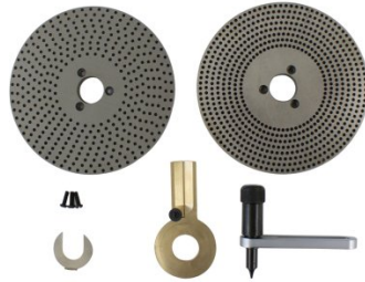
R020 Vertex Dividing Plate