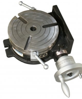
R008 Vertex Rotary Table