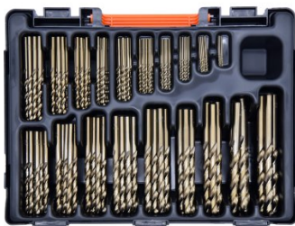
D126 Metric 135° Precision HSS Drill Set - 170 Pieces