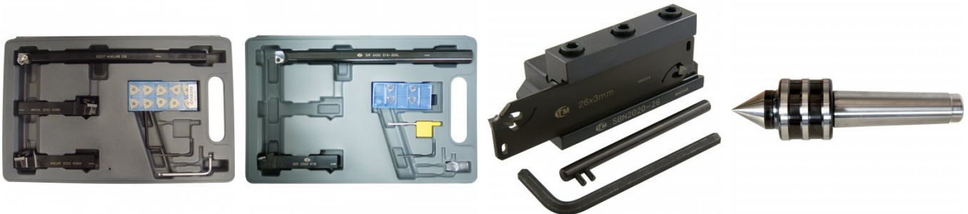
C054 4MT Live Centre