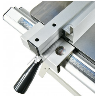
Fence with Quick Action Lock and Sight Glass