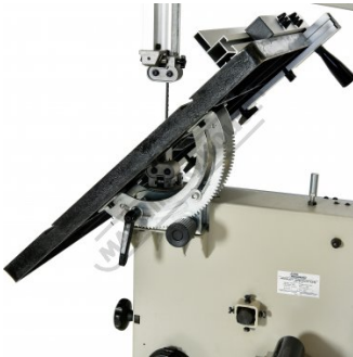
Tilt Table Adjustment