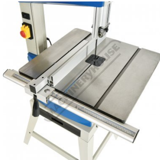
Sliding Rip Fence with High and Low Height Extrusion