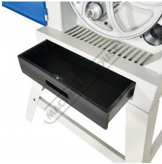
Dust collection Tray