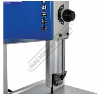
Blade Support Adjustment