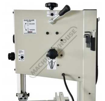
Blade Tension and Tracking Adjustments