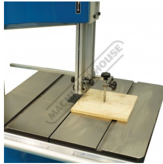
Shown with Optional Circle Cutting Attachment