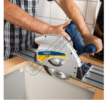
Perfect for kitchen worktops - Shown with Optional Rail