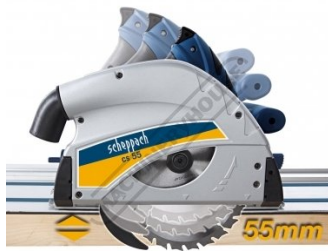
55mm maximum stepless cutting depth