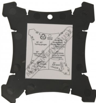
Angle Setting Jig