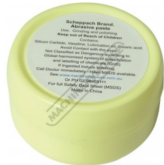
Abrasive Paste For Honing