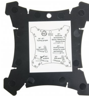
W8637 Angle Guide - 200mm