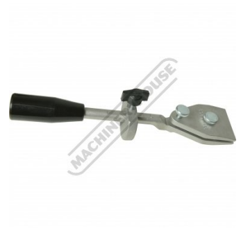
Jig for Knife & Blade Holder