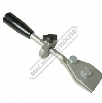
Jig for Knife & Blade Holder