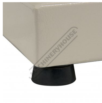
Anti Vibration Rubber Feet