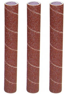
A8112 Bobbin Sanding Sleeves - Pack of 3