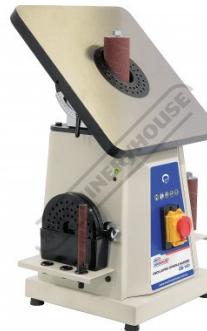
Table Tilted 45 Degrees - Front Left View