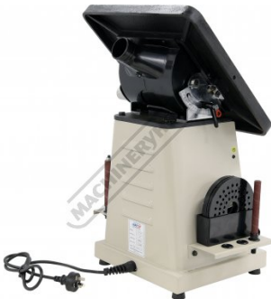
Table Tilted 45 Degrees - Rear Left View