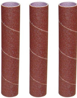
A8114 Bobbin Sanding Sleeves - Pack of 3