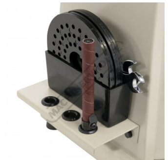
Storage Trays for Table Inserts & Spindles