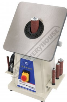
Table Tilted 45 Degrees - Top View