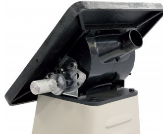
Table Tilted 45 Degrees - Rear View Close Up