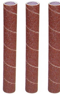
A8110 Bobbin Sanding Sleeves - Pack of 3