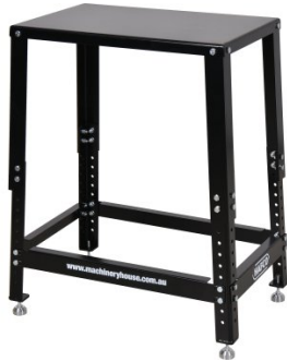
W811 Heavy Duty Universal Stand