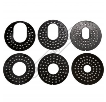
Table Inserts for 90 & 45 Degrees Sanding