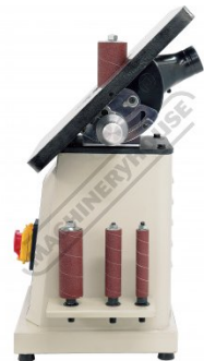
Table Tilted 45 Degrees - Right Side View