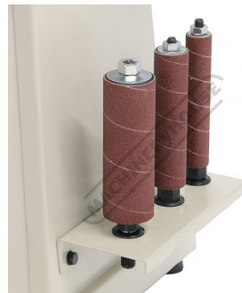
Storage Trays for Sanding Spindles