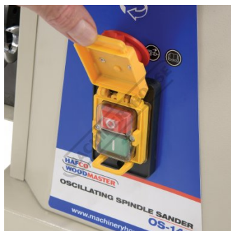
Safety Magnetic Start Stop Switch