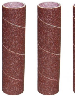
A8118 Bobbin Sanding Sleeves - Pack of 3