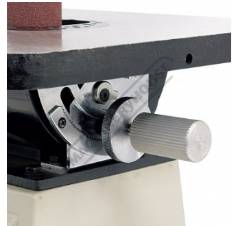
Table Tilt Geared Adjusting Dial & Lock - Left View