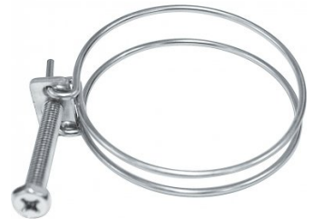
W3405 Dust Hose Clamp