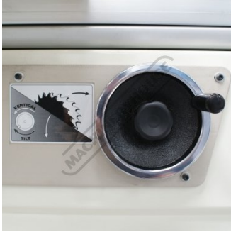
Tilting Arbor to 45 Degrees