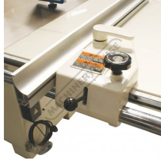
Heavy Duty Rip Fence