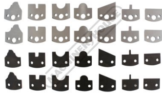
7 Profile Cutters