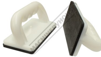
2 x Push Blocks