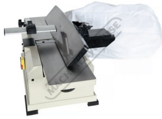
Adjustable Tilting Fence