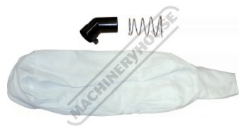
Included Dust Bag