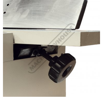
Table Height Adjustment Dial