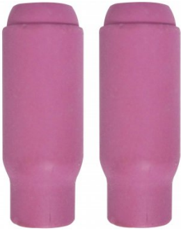
W587 2 x Ø10mm Alumina Nozzles