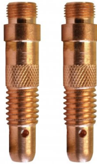
W586 2 x 1.6mm Collet Holders