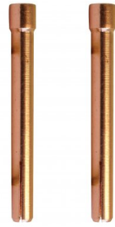
W593 2 x 2.4mm Collets