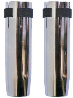
W564 2 x Conical Nozzles