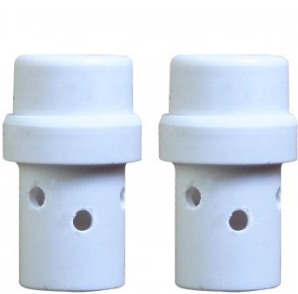
W576 2 x Gas Diffusers