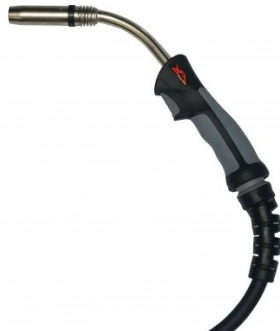
W571 MIG Torch - 4 Metre