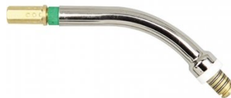
W562A Swan Neck Assembly