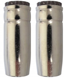
W560 2 x Conical Nozzles