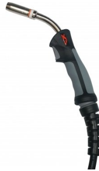
W559A MIG Torch - 3 Metre