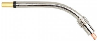
W568 Swan Neck Assembly