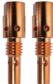
W562 2 x Contact Tip Holders