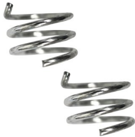
W536 2 x Shroud Springs