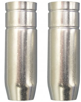
W535 2 x Conical Nozzles