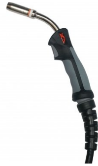
W559 MIG Torch - 4 Metre