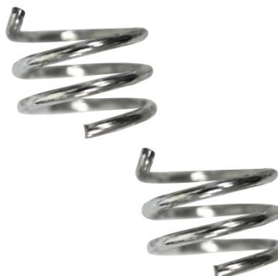
W554 2 x Shroud Springs