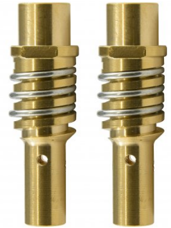
W536 2 x Shroud Springs