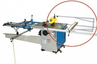
W459 Saw Guard Hood