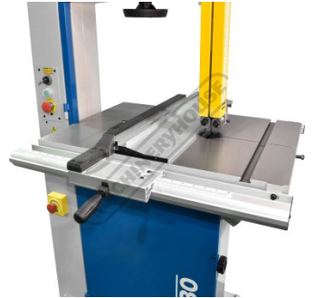
Sliding Rip Fence Down Position