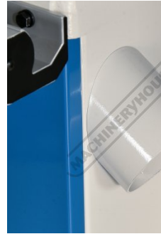
100mm Side Dust Chute