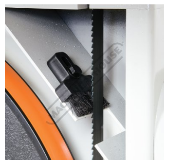
Blade Cleaning Brush