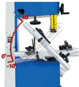
Table Adjustment Angles