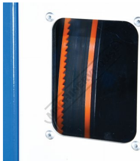
Blade View Window