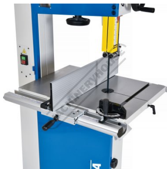
Rip Fence Shown In High Position