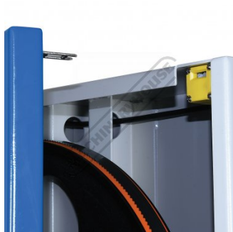
Safety Micro Switch On Door