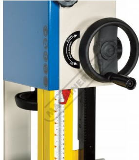
Adjustment Rack Pinion Cut Height