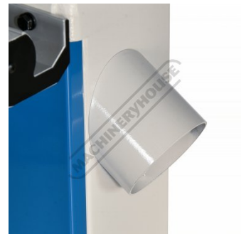
100mm Side Dust Chute