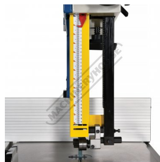
Blade Height Scale