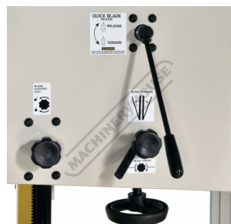
Quick Action Blade Tension Lever