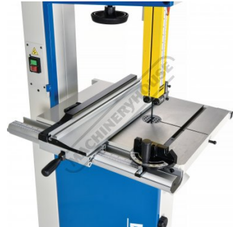
Rip Fence Shown In Low Position