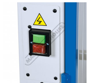
ON OFF Switch