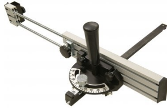
W308 Mitre Gauge & Fence