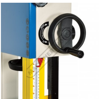
Adjustment Rack Pinion Cut Height