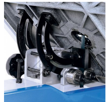
Lower Ball Bearing Blade Guide