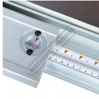
Rip Fence With Magnification Scale View