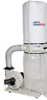
W394 Dust Collector