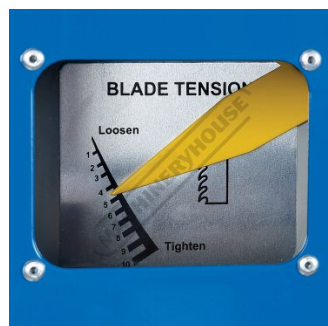
Blade Tension Window