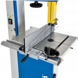
Rip Fence Shown In High Position