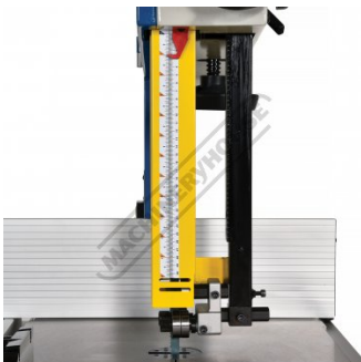
Blade Height Scale