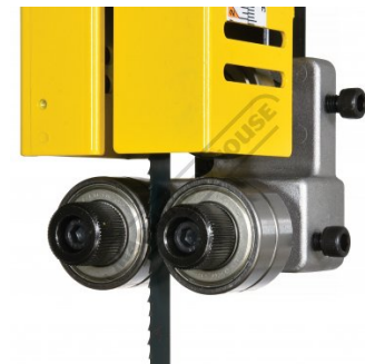
Ball Bearing Blade Guide