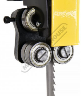
Ball Bearing Blade Guide