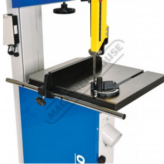
Table With Sliding Fence