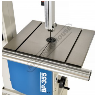
Large Work Table