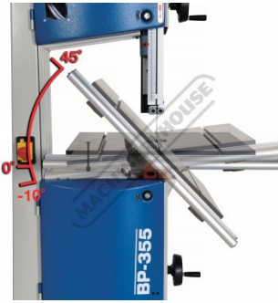
Table Adjustment Angles