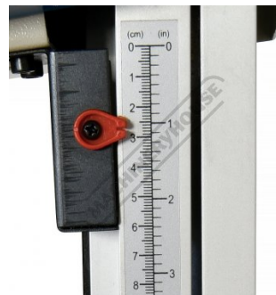
Blade Height Scale