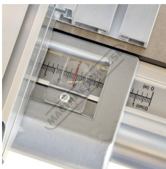
Rip Fence Magnification View Window