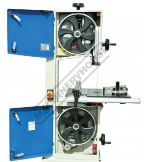
Blade Guards Fitted with Safety Micro Switches