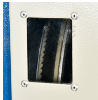
Blade Tracking Side View Window