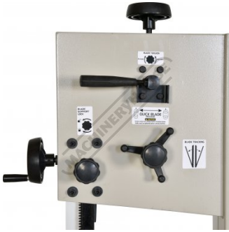
Blade Release Tension - Tracking & Blade Lock