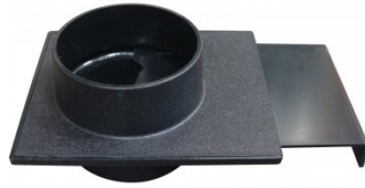
W335 Blast Gate