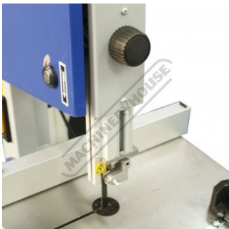
Blade Guide Adjustment