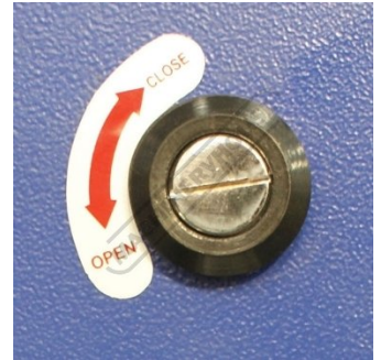
Safety Locks on Doors