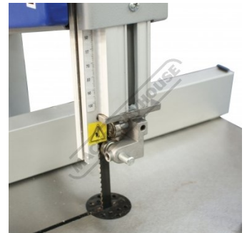
Geared rack height adjustment