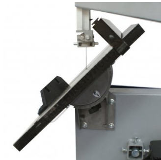
Cast Iron Table Tilts 0 45 degrees