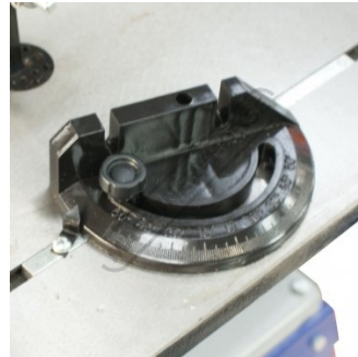
Mitre Guide 0 45 Degrees