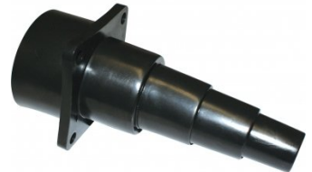
W334A Dust Hose Stepped Reducer