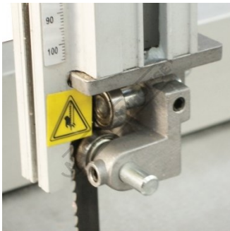
Ball Bearing Blade Guides