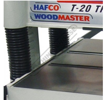
Robust 4 Post Design