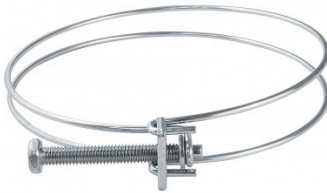
W340 Dust Hose Clamp