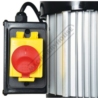
Magnetic Switch Emergency Stop