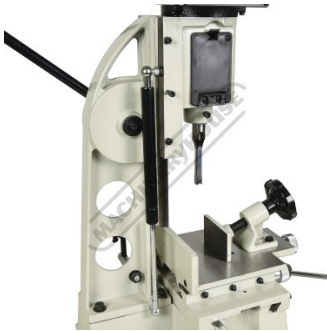
Gas Strut to Counterbalance Head Weight