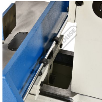
Adjustable table stops