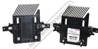
Front and Rear View