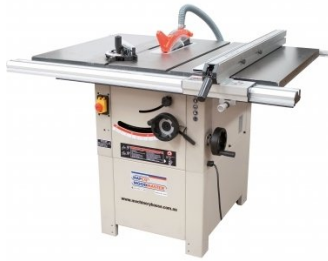
W486 Table Saw