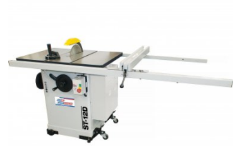
W455 Table Saw