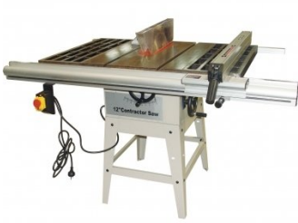
W452 Table Saw