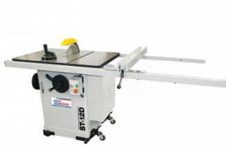
W454 Table Saw